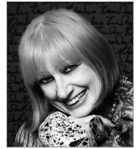
Zandra Rhodes Class of 2013 Fashion/Textile Designer