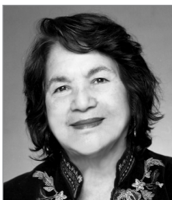
Dolores Huerta Class of 2013

Co-founder, United Farm Workers; President, Dolores Huerta Foundation