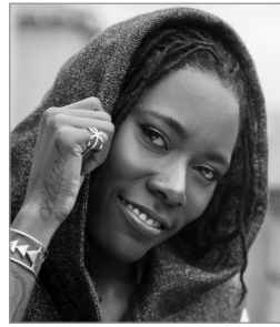
Brittney Reese Class of 2017 Olympic Medalist; Coach, San Diego Mesa College