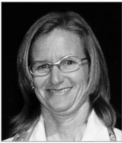
JJ Isler Class of 2002 Olympic Sailing Medalist, Author