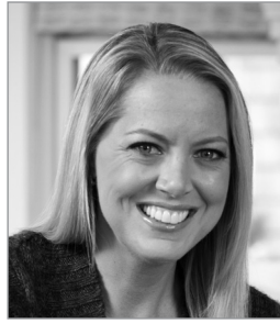
Melissa d'Arabian Class of 2014 Celebrity Chef, Author