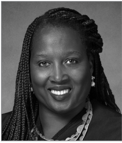
The Honorable Sherry Thompson-Taylor Class of 2024 Judge, San Diego Superior Court