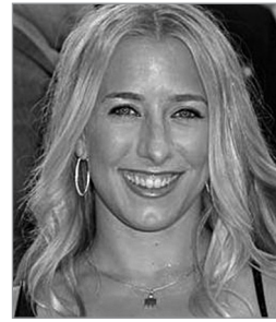
Sarah Reinertsen Class of 2009 Paralympian