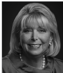
Lynn Schenk Class of 2017 Former U.S. Congresswoman; Attorney