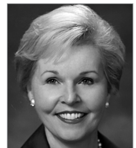
Gayle Edlund Wilson Class of 2010 Education Advocate First Lady of California (1991-1999)